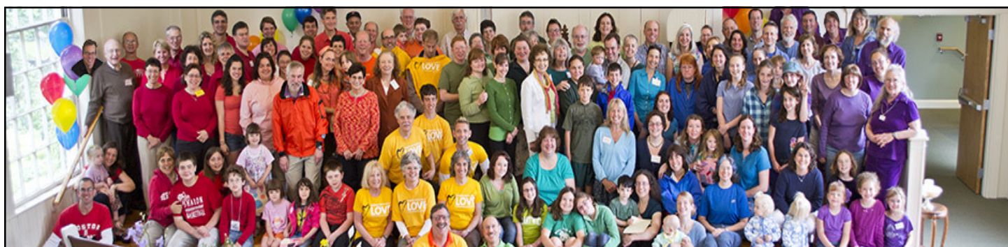
Rainbow Sunday, June 12, 2011