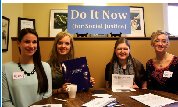
Four Stonehill College Students are educating UCS about how we can go solar.