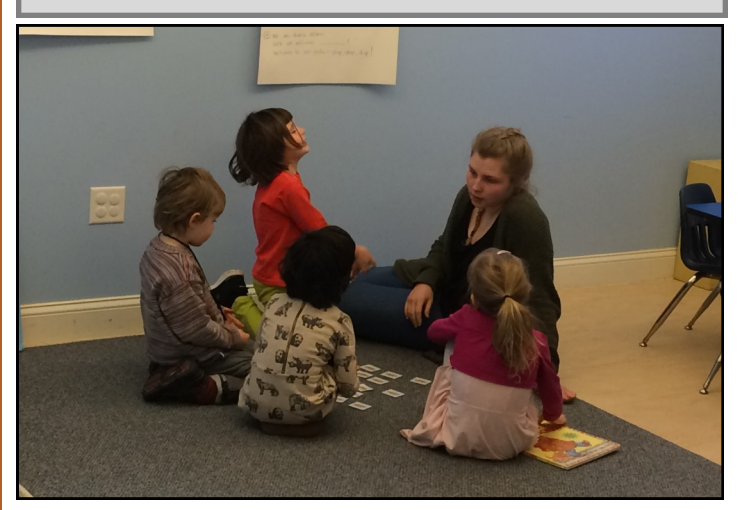
2016/17 Preschool-Kindergarten Class

Parents please check your email for weekly updates about RE happenings.