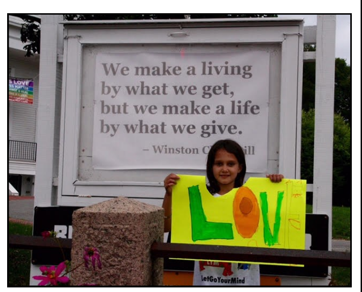
August 15, 2017 - A participant in the Hate Has No Home vigil in front of the Unitarian Church of Sharon

building from the Mission Statement: Our faith traditions call us to love our neighbors and to work for jus tice. We therefore seek to reach across suburban/urban, racial, and class divides to develop relationships with and support the efforts of those people most directly impacted by injustice. The workshops included training in the Four I's of Oppression (Ideological, Interpersonal, Institutional and Internalized). Major emphasis was focused on Power in Relationship, using the framework of 1 to 1, Choosing Issues, Researching