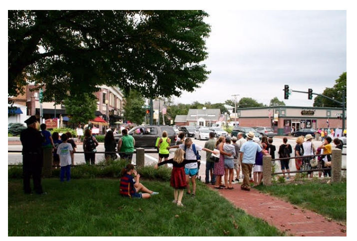
August 15, 2017 - Hate Has No Home Here interfaith gathering in front of the Unitarian Church of Sharon

Action: Several UCS members participated in a recent four-workshop training for Community Organizing sponsored by Sharon Interfaith Action and Brockton Interfaith Committee. The training focused on skill-