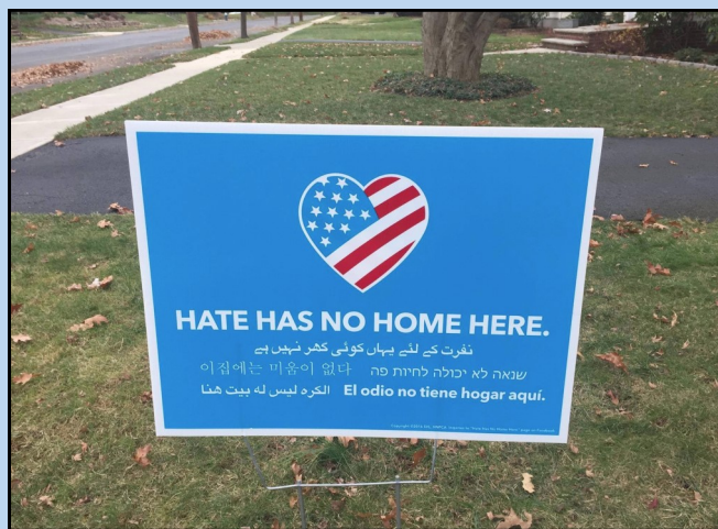
Hate Has No Home Here - A yard sign campaign in Sharon and in many towns across the country.