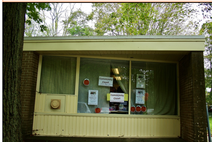
CommUnity Closet in Brockton