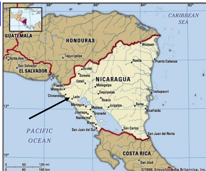
Map of Central America and Nicaragua. The arrow highlights Chacraseca.

Plans are just beginning for a trip in mid-late July 2018 to Chacraseca (a large rural community near the city of Leon), in cooperation with FNE international ( fneinternational.org ). If you've considered participating, but are hesitant about house construction (a key feature of previous trips for youth), please note that we will be planning an itinerary that allows for a choice of activities, including visiting schools, teaching English to adults and/or children, working on gardening projects in the community, meeting informally with community residents, as well as helping build a house and stove with and for a local family. For more information and to meet others who may want to go, come to an informational meeting on Monday, November 6 from 7:00-8:00 pm at church (room TBD). RSVP and direct comments and questions to Janet Schmidt ( jcscoch@gmail.com ).