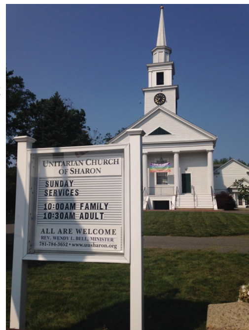
Unitarian Church of Sharon - September 2017

Members of the Worship Committee share some of their experiences, and invite you to reflect on your own.