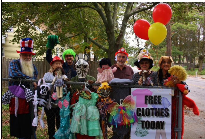
UCS CommUnity Closet volunteers

ria. November funds will support the work MIRA (Massachusetts Immigrant and Refugee Advocacy) and Centro Presente. In December, we will ask for BE donations to help our 5 local food pantries, and donations on Christmas Eve will be shared with MainSpring House, the homeless shelter in Brockton.