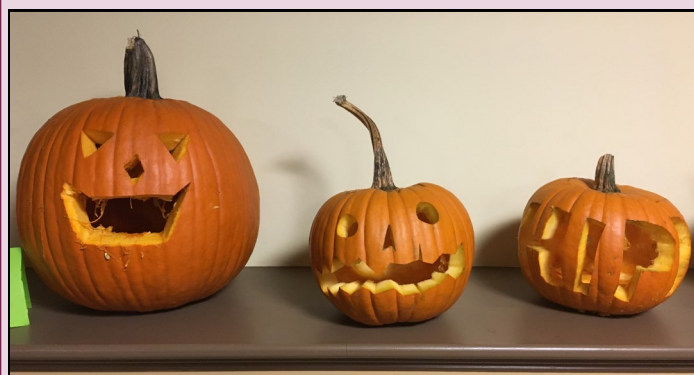
Pumpkin carving by the Senior Youth Group in October 2017