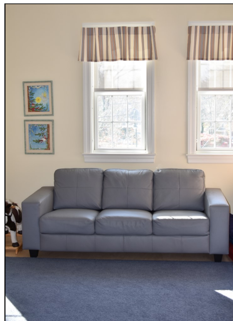
New couch in the Nursery.

Your group may reserve the Nursery through the church calendar feature on the church website.