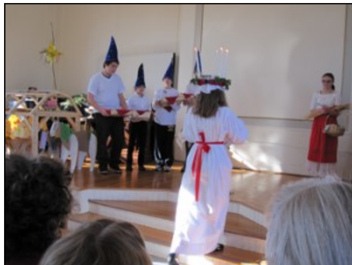
Past Revels Service - Santa Lucia walking up the steps