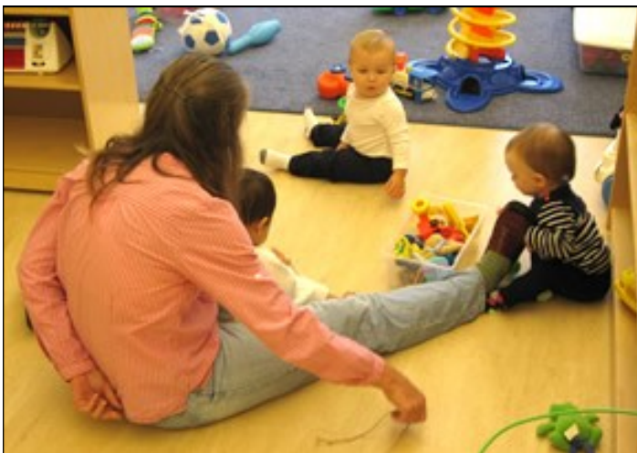
Childcare at UCS—picture taken in the Nursery