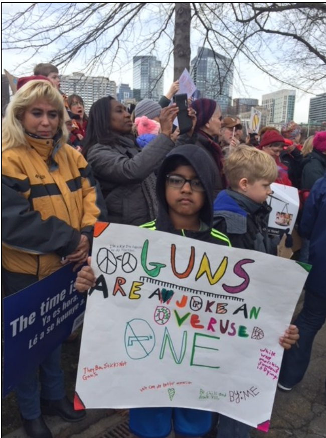
March 24, 2018: UCS youth holding his sign at March for Our Lives