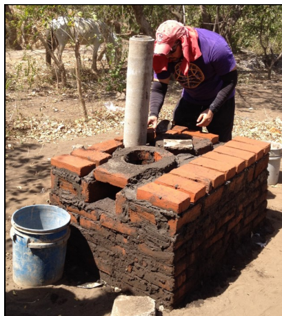
Stove: Building a more efficient and safe stove is a one-day project.

What: Activities that can be included: House and stove construction (tasks for all abilities), led by experienced and skilled local builders; visits and interactions with students and teachers in schools, teaching English to adults and/or children, working on gardening projects in the community, learning about Nicaraguan history and culture, meeting informally with community residents. Spanish speakers of all levels are welcome (even if you know