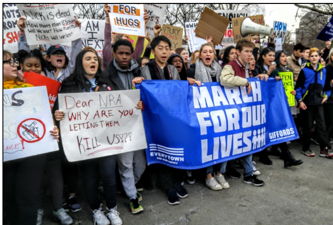
March 24, 2018: Children - the leaders in March for Our Lives in Boston

We had all been hearing the message of the march - Enough is Enough - Change is Needed. Everything was familiar. We gathered along the route of the march to wait for the kids to arrive, phones and cameras ready to