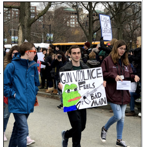
March 24, 2018: March for Our Lives in Boston