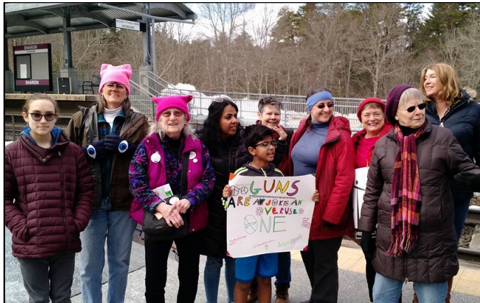
March 24, 2018: UCS members at the train station leaving for March for Our Lives in Boston.

On Saturday, March 24, several members of our congregation gathered at the Sharon Train Station for our trip into Boston in support of the "kids" who would be marching in the March For Our Lives - The morning was sunny, with no rain or snow. Most of us in the group were experienced marcher-protesters, dedicated to social justice. It was a familiar scene, everyone with protest signs ready to be held high when we would be standing on Boston Commons in support of the kids, the students, the survivors of the Parkland shooting and their allies. We headed out on the crowded train to Back Bay Station and a short walk to the Commons. Along the streets in Boston, the mood appeared to be upbeat, people gathering with signs and heading to the march.