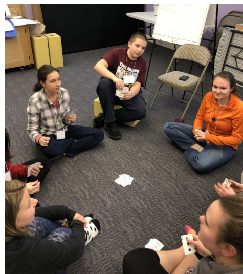
March 24 –25th, 2018: UU Youth CONvention hosted at UCS - on the pictures youth working on a group puzzle and playing cards.