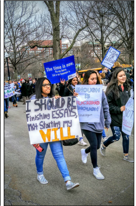
March 24, 2018: March for Our Lives in Boston. UCS members and other protesters with signs