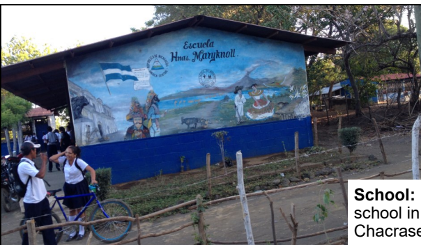
School: A school in Chacraseca.

only a phrase or two; translation will be provided).