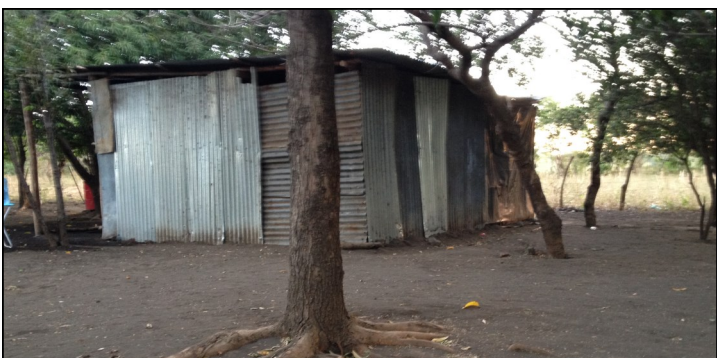
Old House: Many houses in Chacraseca look like this. FNEI's program helps replace them with sturdy brick houses.

April BE funds will be collected to support the volunteer work of the Nicaragua Service Trip happening this summer (see below for details on the trip). While participants will cover their travel and local expenses, we hope to raise a portion of the $2500 that they will need to provide for materials to help build a house in Chacraseca.