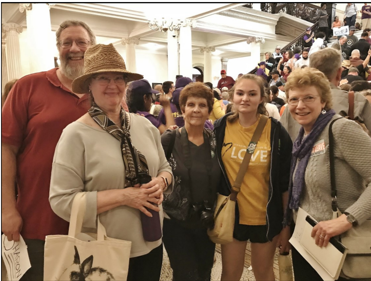
Raise Up MA: Some UCS members and a friend