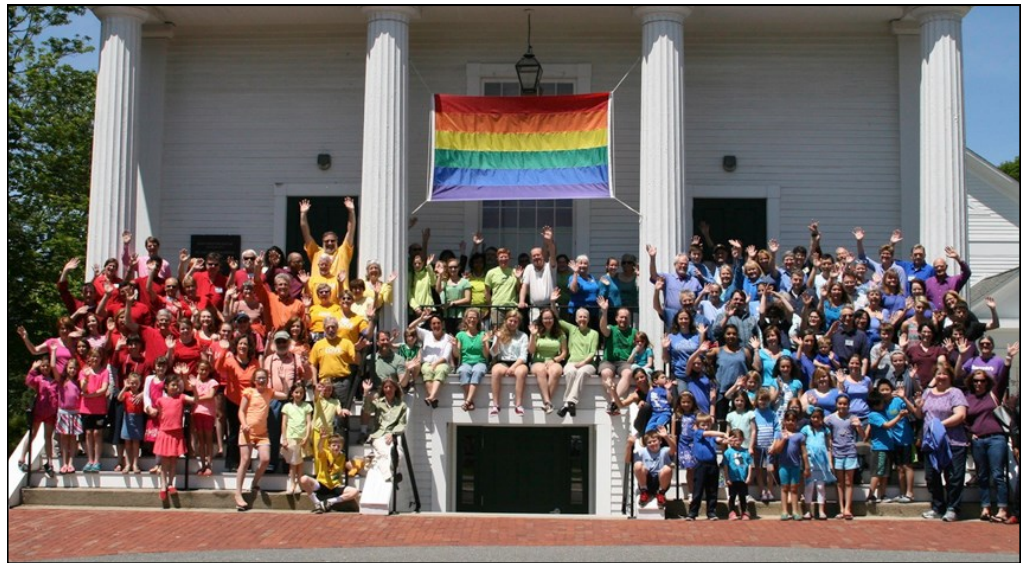
Past picture of Annual Pride Celebration - join us for this year's UCS rainbow photo after Rainbow Service on June 3rd

On June 3, the Unitarian Church of Sharon will celebrate our annual Rainbow Sunday. On Rainbow Sunday, we honor the diversity in our congregation and that we are a welcoming congregation. During the adult service, we will have a guest speaker from Freedom for All Massachusetts who share with us about TransLawMA and how we can help defend transgender equality in Massachusetts. Please plan to attend on Rainbow Sunday, and wear a shirt with a color of the rainbow for our annual UCS photo after the service.