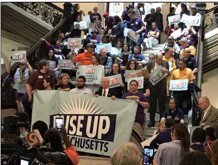
Raise Up MA: On the Grand Staircase at the MA State