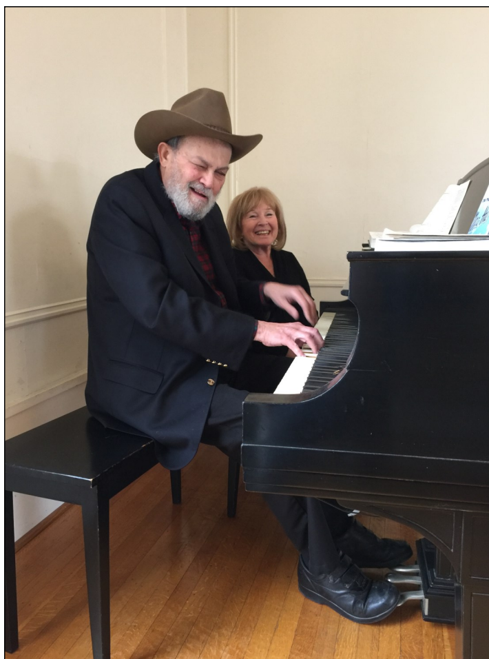
Sunday, April 15 - Worship Service When talking about guns piano players grab Western hats

Saturday, May 5th is Green Day! New location: Sharon High School from noon to 4pm. Sustainable Sharon Coalition's annual sustainability festival with music, local vendors and organizations, crafts, and games. Fun for the whole family.