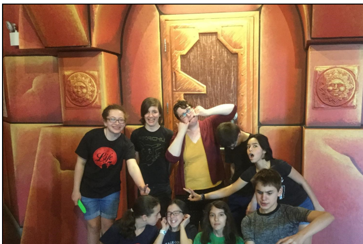
Sharon Unitarian Junior Youth