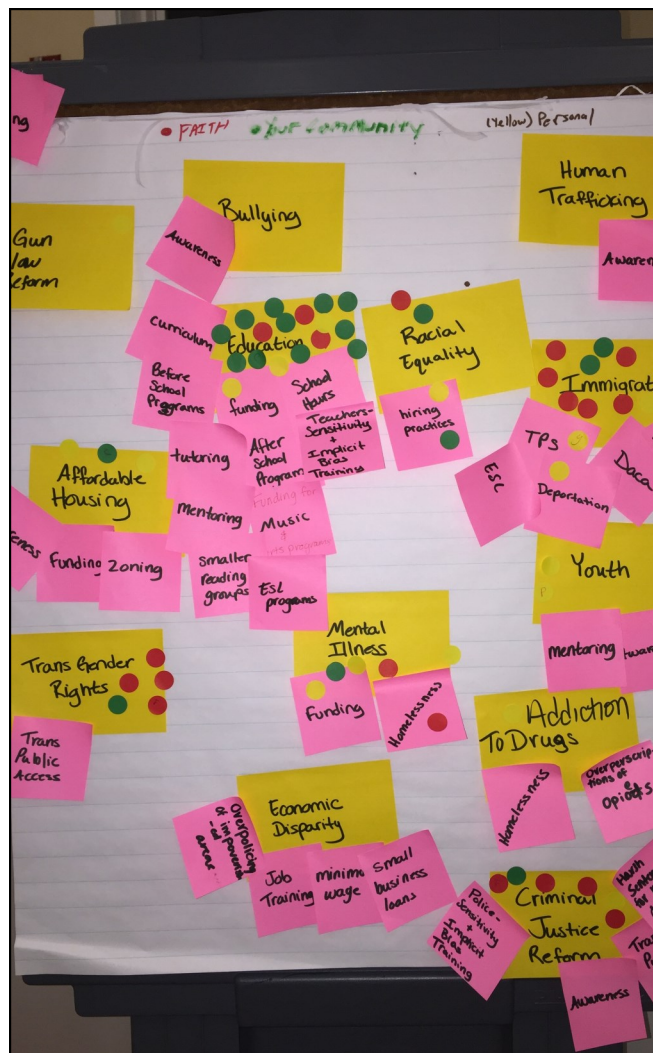
BIC Convention: Issues raised in Brockton by a group of Brockton participants