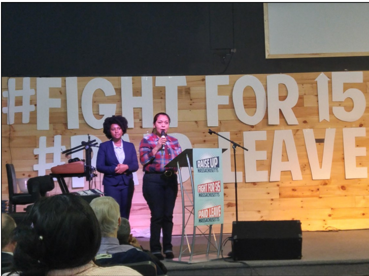
RAISE UP Mass: Sharing stories of working in low wage jobs

SJ Corner in the Vestry: Following Sunday worship services, you can buy Equal Exchange fair trade coffees, chocolates and other items, as well Shopping for Justice supermarket gift cards in various denominations for Shaws, Stop & Shop, and Big Y (+/-5% of the value stays with the church to help fund our social justice projects in support of people who experience food and housing insecurity). You can also purchase note cards created by Kari Thostenson with beautiful photographic images, with all profits supporting the social justice projects of the church.