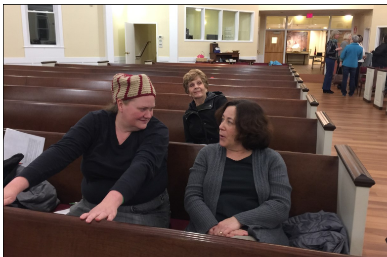
BIC Convention: A few of the UCS participants in the Convention