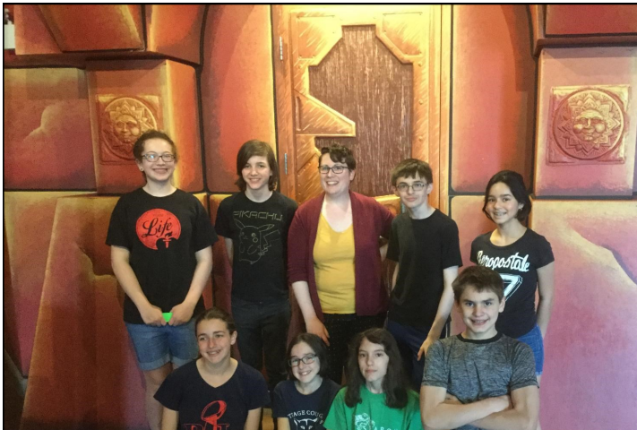
Sharon Unitarian Junior Youth

UUA GENERAL ASSEMBLY , the national annual meeting and conference of the Unitarian Universalist Association, will be held June 20-24 in Kansas City, MO. This year's theme is "All Are Called." All congregations are invited to send delegates to the meeting, and anyone may attend, Go to www.uua.org/ga for more information and registration.