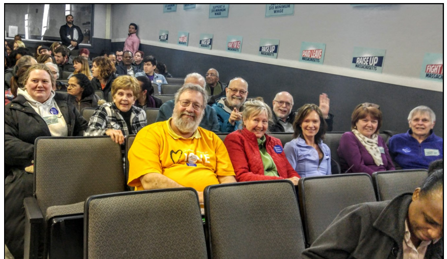
RAISE UP Mass: UCS members at Fight for 15 in Brockton

The Closet, located at the UU Church of Brockton, 325 West Elm Street, is open every month on the second Saturday. We continue to collect new and gently used clothing for all ages (Spring and Summer) in the Vestry. Men's clothing is especially needed, as well as new socks, underwear, women's sanitary products, and reading glasses. Volunteers are needed to help sort and organize the donations. Please contact Jim Mullin for more information and to volunteer.