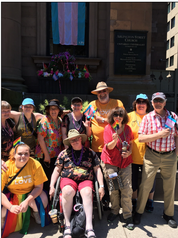
Gathering for the Pride Celebration Service at Arlington Street Church before the Boston Pride Parade