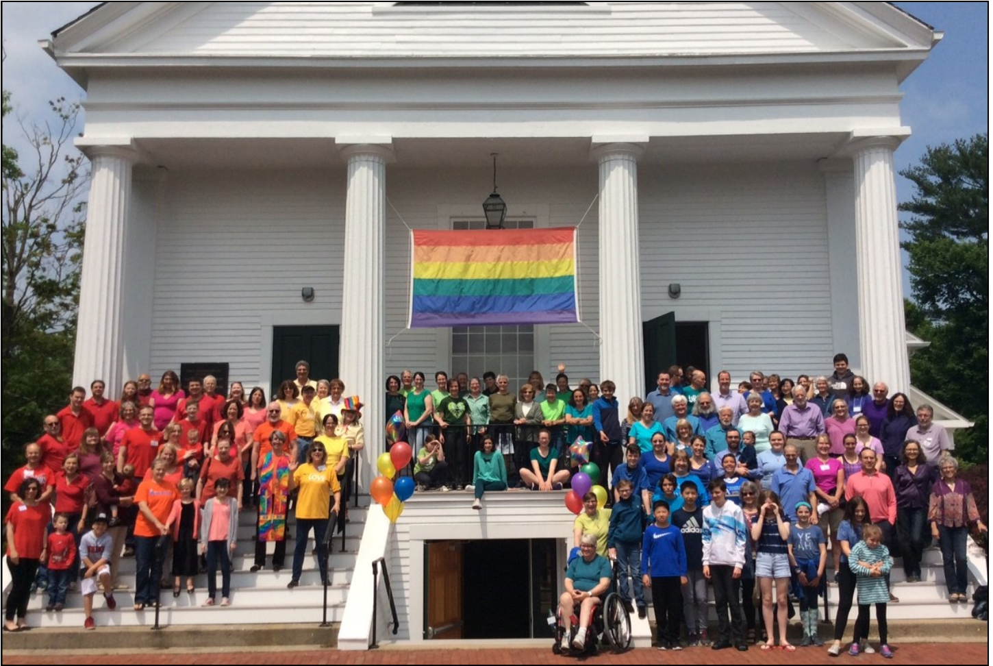
Our Celebration on Rainbow Sunday