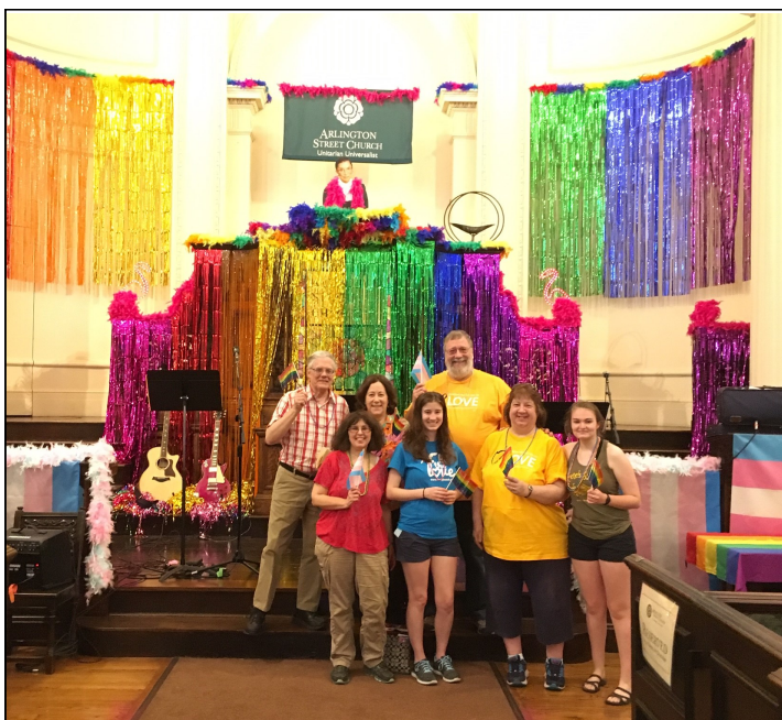
PROUDLY gathered inside Arlington Street Church – and look who's in the pulpit!