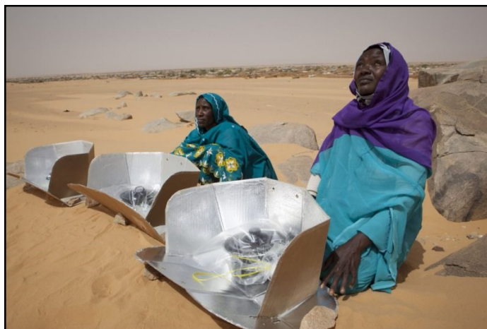
African women using solar cookers

In an effort to offset the environmental impact of sending two delegates from the UCS to the annual General Assembly in Spokane, WA this past June, funds were raised to purchase carbon offsets on their behalf. We are sending $125 to the Fair Climate Fund in the Netherlands to help purchase solar cookers for refugee families in Chad. [