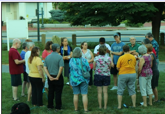
August 8, 2019: Vigil in Response to Mass Shoot-