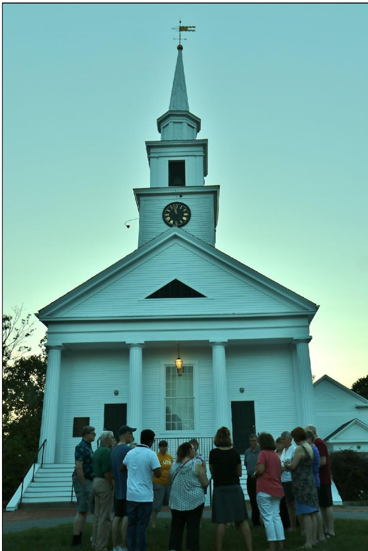
August 8, 2019: Vigil in Response to Mass Shootings