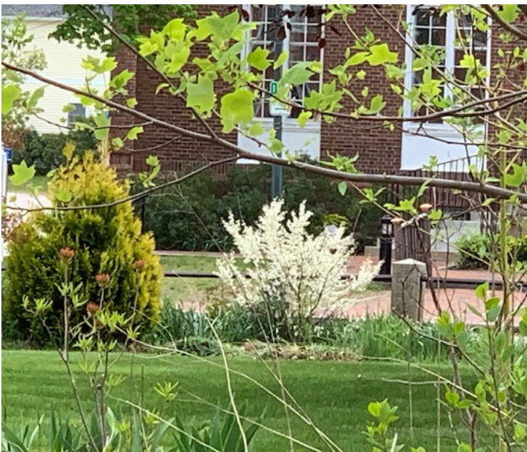
The plants on this page are from the garden of the church.