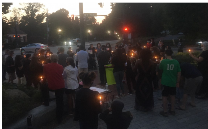
Sharon gathers for a vigil in memory of Breonna Taylor

Blue Hills SUNRISE chapter celebrates 1 year anniversary with UCS sponsorship. Our church was acknowledged with "The Supporter Award" at a lakeside, socially distant picnic on September 25th.