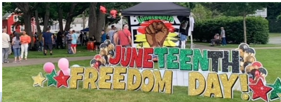
Juneteenth celebration in Stoughton