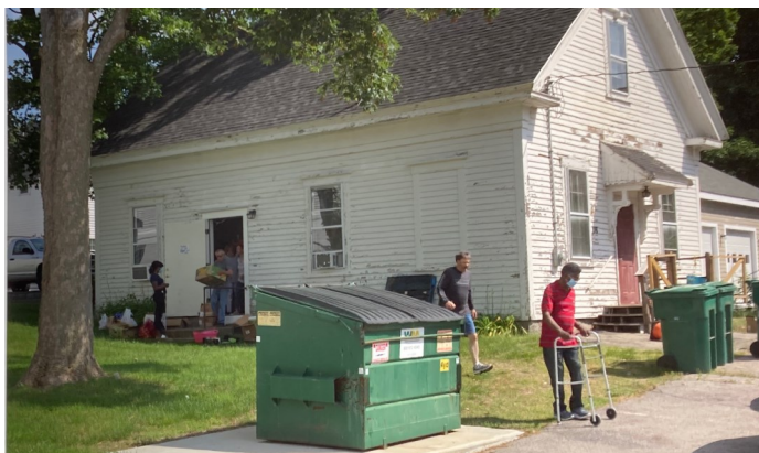
Sharon-Stoughton Food Pantry where hundred of our neighbors turn to us for help.

Donations to local food pantries over the past 15 months during the Covid crisis have now totaled over $41,000, a remarkable effort that has benefited countless families in need throughout our neighborhoods. Sadly, the need continues, and your ongoing support is greatly appreciated.