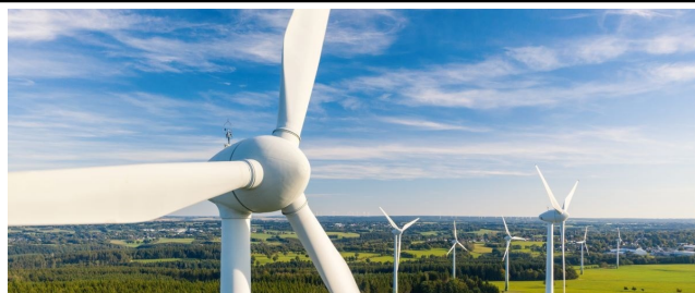
100% Green electrical power now ours by choice at UCS

Time for a Green Celebration! At our annual meeting in June, the congregation voted for UCS to purchase 100% renewable electricity for the coming year. Yippee! The Green Team will be back in action in the fall, helping UCS continue on our eco-responsible path. In the meantime, please review your own household's commitment to achieving a sustainable planet, and together we can work to move the needle on climate change.