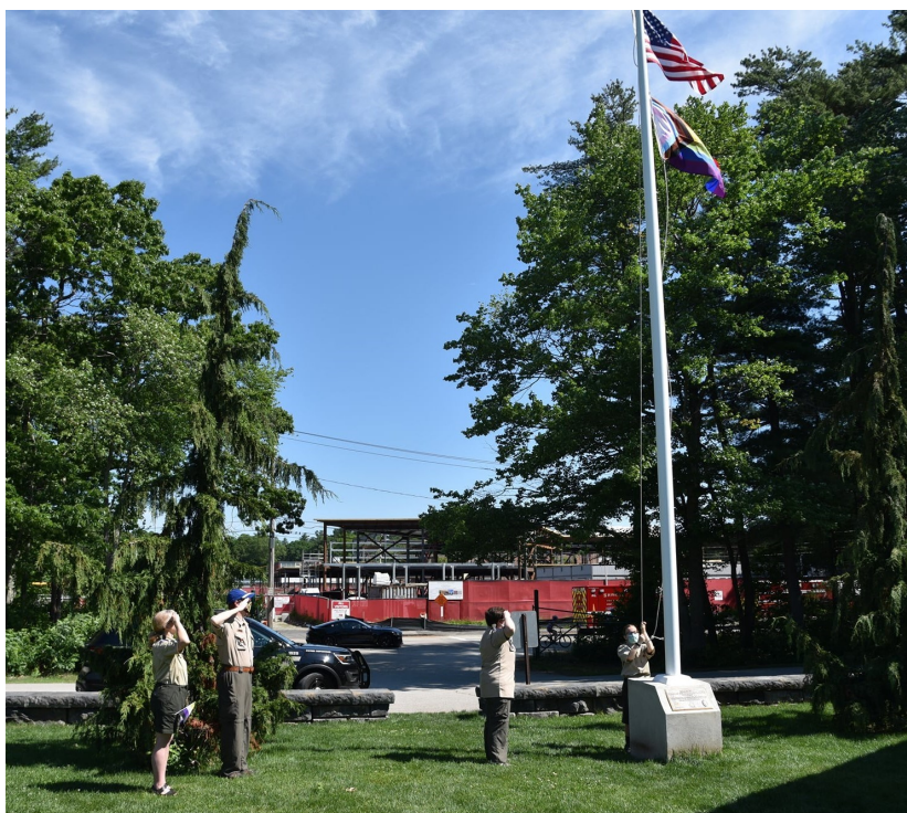
BSA Troop 164 raises the American Flag and Progress Rainbow Flag at Sharon Memorial Park. Rainbow flags were also displayed at the Sharon Public Schools.