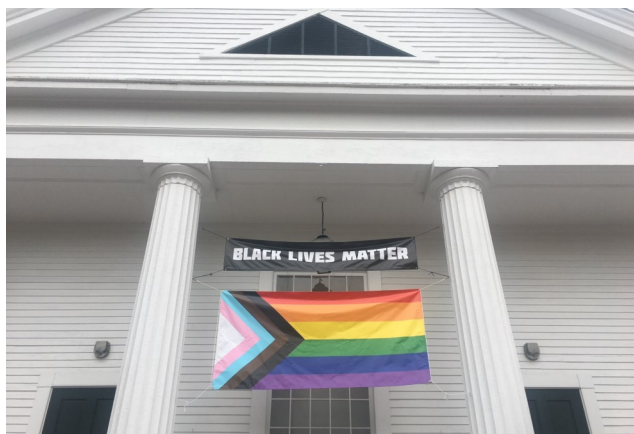
BLM Banner and Progress Rainbow Flag remind our community about the work that remains to be done.