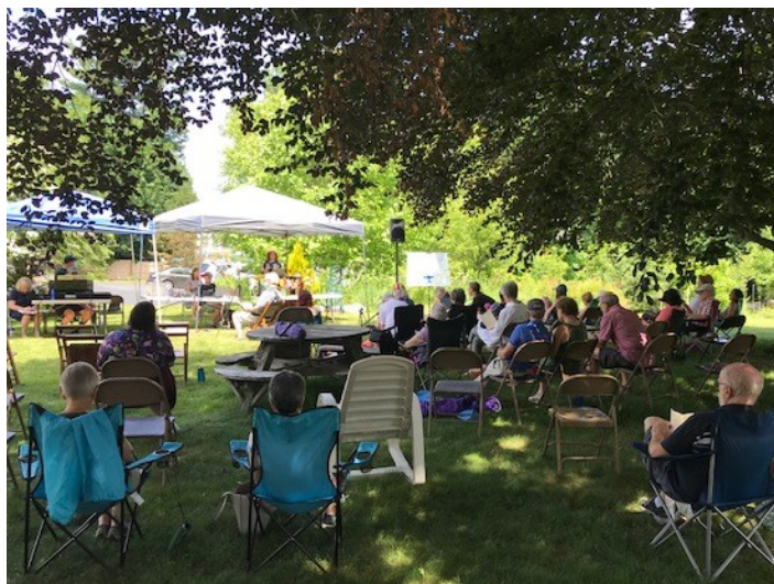
June 20: Outdoor Flower Service