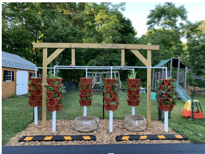
Our Stackable Garden takes the hot summer days in stride