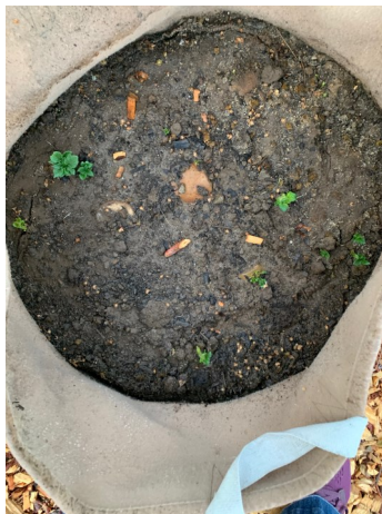
Potato sack experiment gets underway.