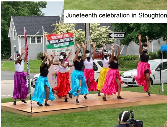
Walpole and surrounding towns celebrate Juneteenth