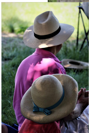
Cool hats and hot rainbow colored shirts ruled the day.