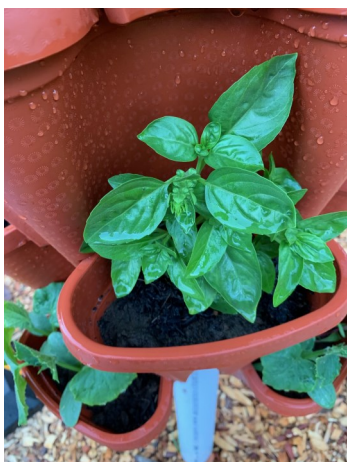
Luscious plants benefit from T.L.C. by our Green Thumb Crews

The Stackable Garden is growing! We have already harvested some kale and Bok Choi. Recently, we added potato bags, and we hope to add drip irrigation soon. Alan Post and Gare Reid are also working on a plan to set up two rain barrels to collect rainwater to replenish our future solar-powered drip irrigation system. Thank you to all who are participating in this collaborative project. Stop by the church grounds to see what's growing!