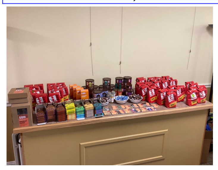
So, what does it take to keep this congregation going through a busy holiday season? Here's what went out the door at the December Fair Trade Marketplace! You can restock your shelves for 2022 on