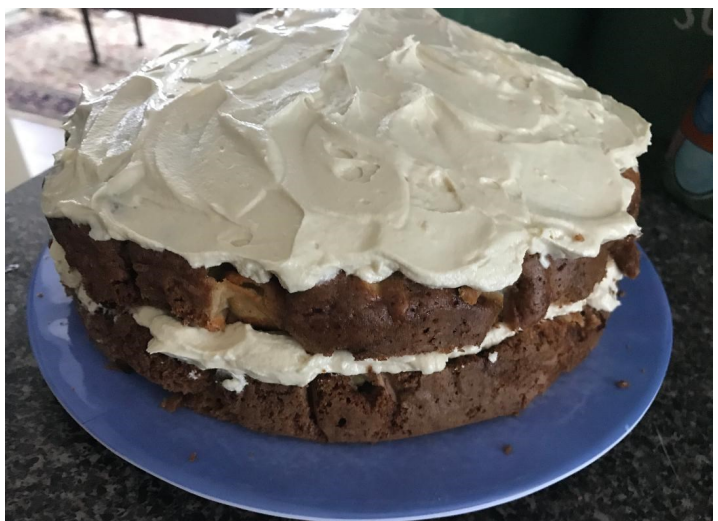
Carrot Cake with Ginger Mascarpone Frosting - It could have been yours!