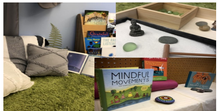
Scenes from the new multi-age SpiritPlay classroom -Opening in March!

We are also very excited to be able to gather back in person both for SYG and for JYF! Junior Youth Fellowship will be meeting March 13th from 1:00-2:30pm. Stay tuned for more information on that event!