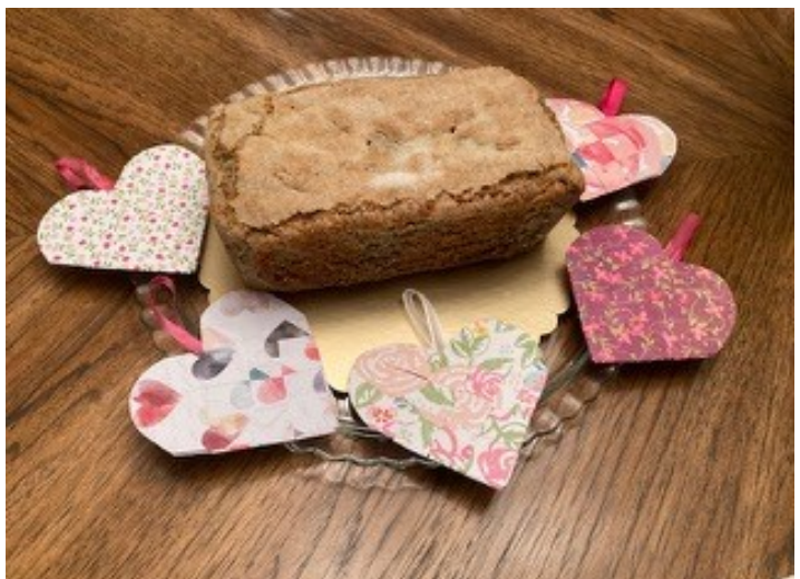
Earl Grey Yogurt Loaf - A recent offer in exchange for a Food Pantry donation - Coming from a Kitchen near you!

Several of our fabulous UCS bakers have resumed an occasional offer of fine baked goods in exchange for donations to the Food Pantry Project. As a means to highlight the need, and to build connections within our own congregation, Elaine Price, Elizabeth Siftar and others are offering baked goods on a "claim it and it's yours for a Food Pantry donation" basis; look for email notices in the UCS Social list and make your commitment asap. We have also seen offers of high-quality household items being offered in exchange for donations to the Pantries - what a creative bunch we are! Missed out on your chance for a cake or a loaf? Go ahead and donate anyway (checks mailed to the church, online portal donation, or actual food stuffs in the outdoor collection bin at the church entrance are all easy options) and try again in the weeks to come. Not on the email list? Simply send an email to Social-subscribe@lists.uusharon.org and you will receive a confirmation e-mail and instructions for what to do to join this fun effort to support our community members in need.